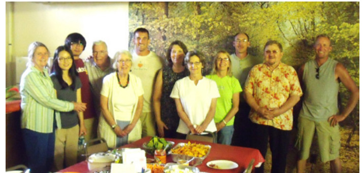
Volunteers and Residents at a Monthly Get-together